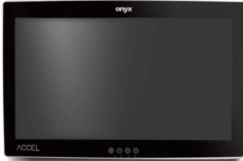
Power on / off LCD Brightness Touch Screen on/off